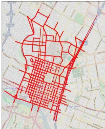
FIGURE 2 Downtown Austin network

Table 1 compares the travel times for all four intersection control policies at different demand levels. Reservations using all policies (including FCFS) consistently had much lower total system travel time (TSTT) than traffic signals. Although Levin et al. (5) found several situations in which FCFS reservations would increase delay compared with signals, there are also scenarios (such as symmetric intersections) in which FCFS is likely to reduce delay (3, 4). Both backpressure and P_0 made significant improvements over FCFS as well. This is not surprising because FCFS does not prioritize links with higher demand, which could cause queues to build up and spillback on such links. Backpressure also consistently performed slightly better than P_0 . This is probably because backpressure is more responsive to current traffic conditions than P_0 . P_0 was developed for a model with link performance functions, in which travel times could be easily calculated. However, in simulation-based DTA, travel times are determined by simulation. Therefore, high travel times were only observed after vehicles had exited the link, which delayed the effect of queuing on the P_0 prioritization. In contrast, backpressure prioritized based on queue lengths at the current time. Therefore, backpressure responded faster and more dynamically to congestion and queueing.